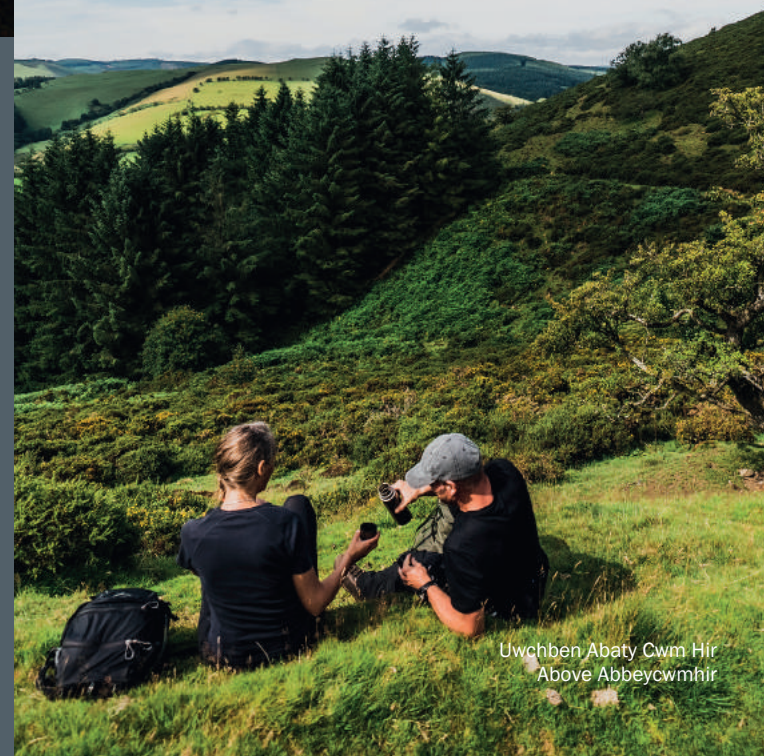
Uwchben Abaty Cwm Hir Above Abbeycwmhir