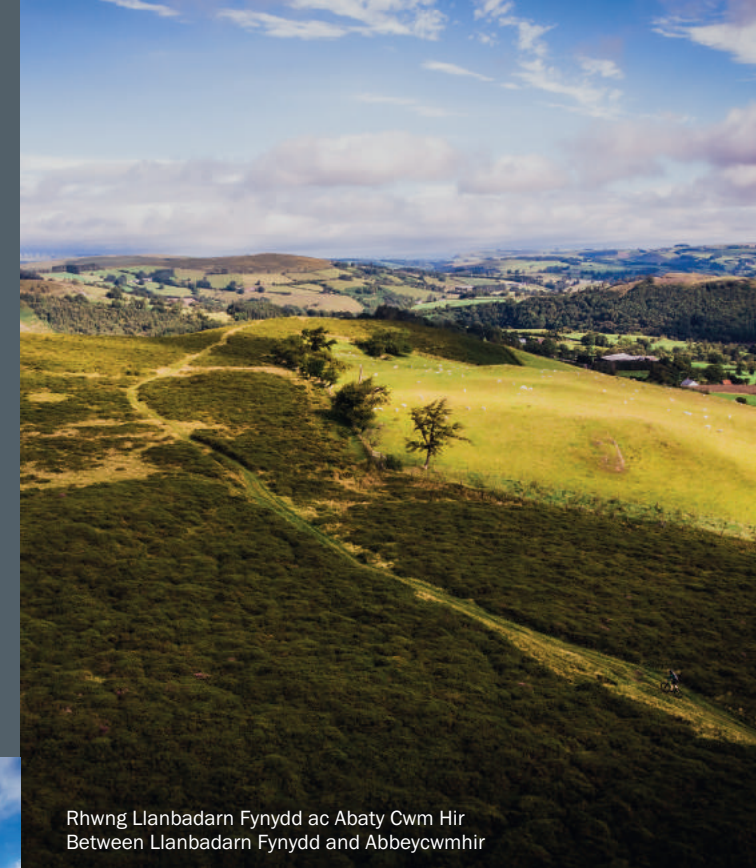
Rhwng Llanbadarn Fynydd ac Abaty Cwm Hir Between Llanbadarn Fynydd and Abbeycwmhir