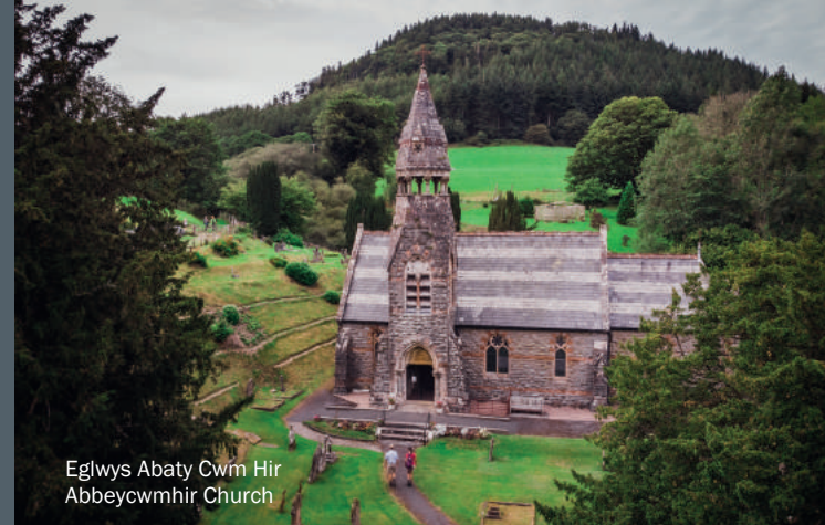
Eglwys Abaty Cwm Hir Abbeycwmhir Church