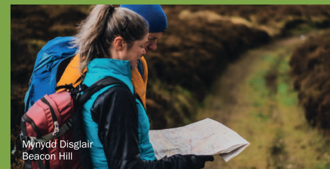
Mynydd Disglair Beacon Hill

www.nationaltrail.co.uk/en_GB/trails/glyndwrs-way